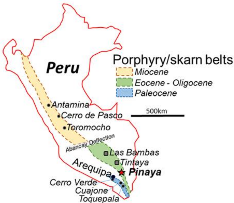
Figure 1: The Pinaya concessions include over 10 km of underexplored strike length in the heart of the Andahuaylas-Yauri Porphyry-Skarn Belt

On July 1, 2019, the Company signed three contracts with the community of Pinaya. The contracts comprise an Usufruct Agreement for the Mina Pata parcel; a Social Support Agreement; and a Collaboration Framework Agreement.